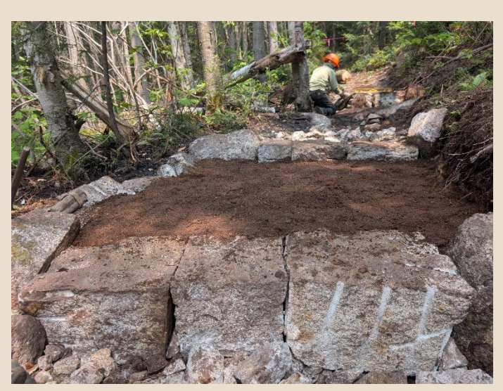
Rock Step After