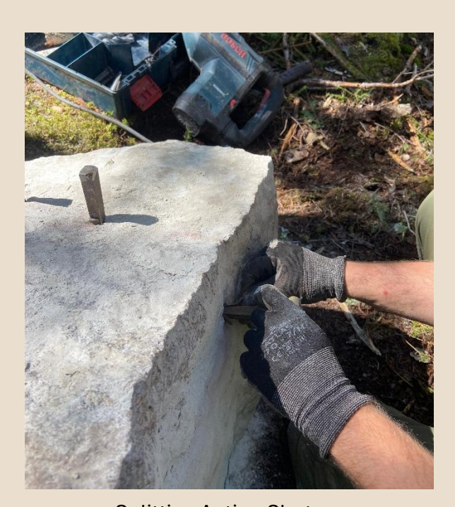
Splitting Action Shot

Successes: In the first two weeks the crew rebuilt a rock waterbar, built three new steps, filled in crush pads, and quarried stone. The beginning and ends of the relocation were opened and connected to the old trail and the area was reveged heavily. This work brings the third relocation section close to being completed.